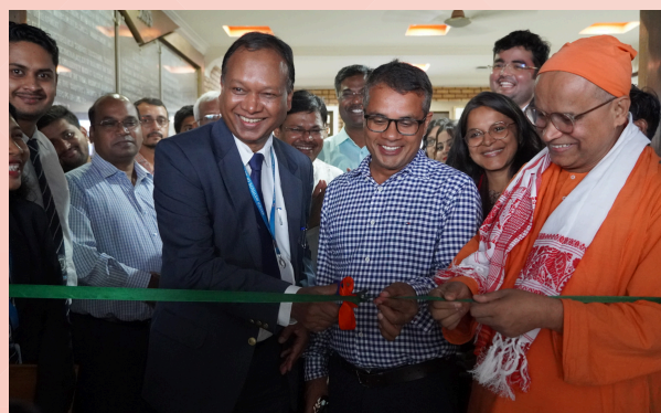
XISS & SwitchON Foundation organizes "Move for Earth Symposium 2025"