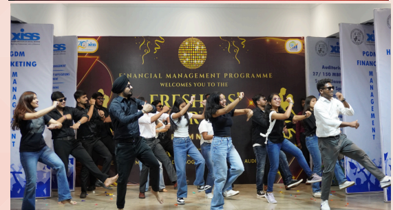
Fresher’s Day marked a warm welcome for the new batch of 2025-27