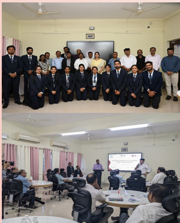
Jharkhand Local Governance Symposium organised

The event displayed field insights by RM interns on governance themes across five districts.