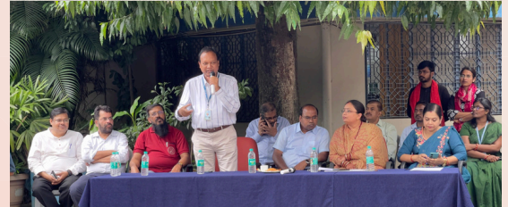
Awareness Through Art: Rural Development Street Play organised at XISS