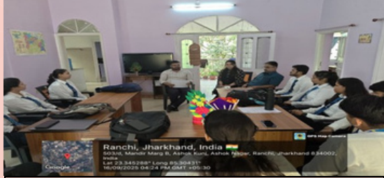
Marketing Management students conduct Live Project

11 students of the first year of Marketing Management Programme of XISS conducted a Live Project on a Local Market and Consumer Behaviour Survey in the Ranchi and Khunti districts for KCT Group CSR. This was part of the groups ongoing livelihood initiatives for rural and tribal women in Jharkhand.