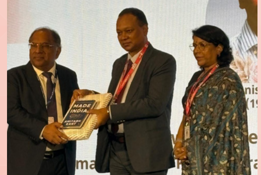
13th Awanish Dev Memorial Lecture organised by XISS & MSIL