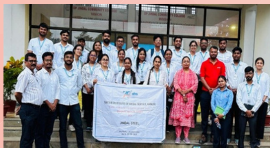
Second Institutional Visit for Rural Management Students of Batch 2025–27

The Institutional Visit is a part of field exposure for first-year Rural Management students that takes them beyond the classroom to rural areas where they observe organizational interventions and development initiatives. The visit provides firsthand insights into programme implementation at the grassroots level. Its objectives are to familiarize students with real-world development interventions and help them understand the challenges in planning, implementing, monitoring, and evaluating projects. The second IV for the first-year students (Batch 2025–27) was organized on 29 August 2025 to provide a broader knowledge of development interventions and field-based practices across various sectors.