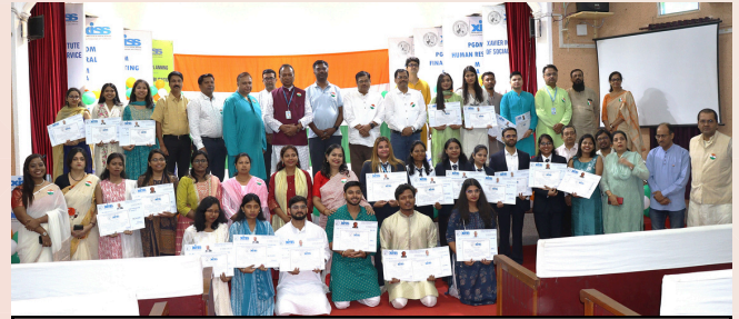
Rs 8.70 lakh worth Institutional Scholarships awarded to 27 meritorious students

Three Institutional Scholarships worth Rs 8,70,000 were awarded to 27 students of the Programmes of Marketing Management, Human Resource Management, Rural Management, and Financial Management. These included the Fr Michael Van den Bogaert SJ Memorial Scholarship for meritorious students of SC/ST category, Fr Michael Albert Windey SJ Memorial Scholarship for meritorious students on the whole, open to all categories, and Fr Louis Francken SJ Memorial Scholarship for overall performance in all categories.