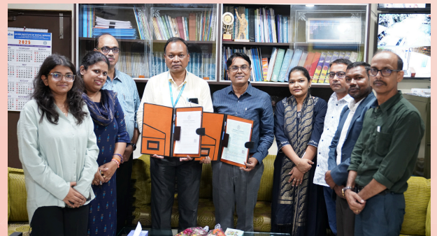
XISS and CInI sign MoU

The MoU signed aims to synergize the academic-rural-community ecosystem and make a sustainable, long-term impact, especially in rural and tribal regions of Jharkhand, drawing on the successful models pioneered by CInI, such as the "Lakhpati Kisan" initiative, which helps farming households rise irreversibly above poverty through integrated livelihood strategies.