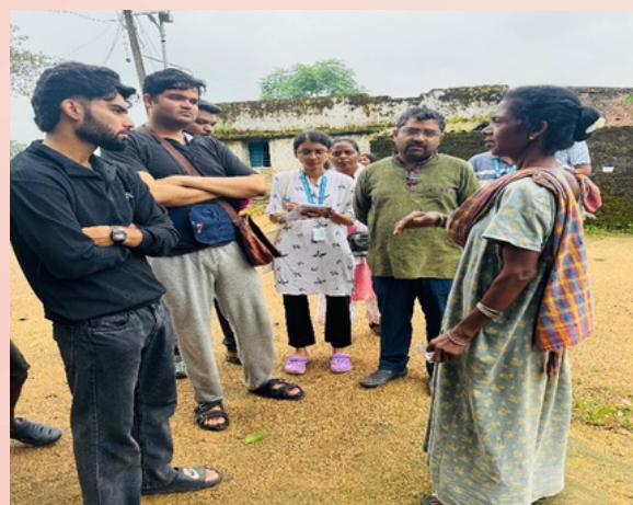
Rural Field Exposure for RM Batch 2025–27

The camps were held from 13–22 September 2025. Their objectives were to acquaint students with the realities of rural life, establish rapport with the villagers, and conduct socio-economic surveys to gain insights into aspects such as culture, food habits, education, livelihood, agriculture, health, and local governance.