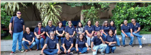
XISS hosted Alumni Reunion of PGDM PM, Batch 2000–2002

XISS had the pleasure of hosting 19 distinguished alumni from PGDM PM, batch of 2000–2002 on 16 August 2025. The reunion was held in the afternoon, bringing cherished memories, warm camaraderie, and a spirit of connection between the institute and its proud alumni.