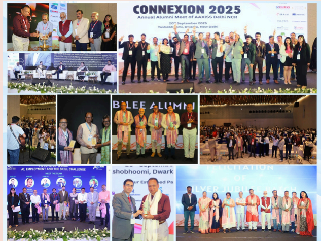
AAXISS Delhi Chapter held panel discussions during the Connexion-Alumni Meet 2025