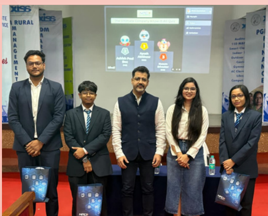
XISS organised Leadership Talk by National Payments Corporation of India (NPCI)

The session offered students valuable insights into the dynamic and fast-evolving fintech ecosystem.