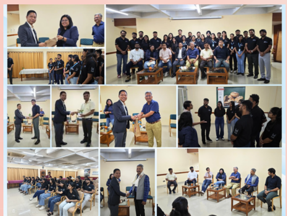
AAXISS Hyderabad Chapter organised engaging panel discussion during the Alumni Meet 2025