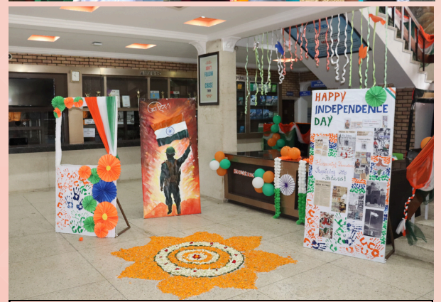
79 th Independence Day celebrated amidst joy and fervor

Click on the link to read the names of the students awarded: