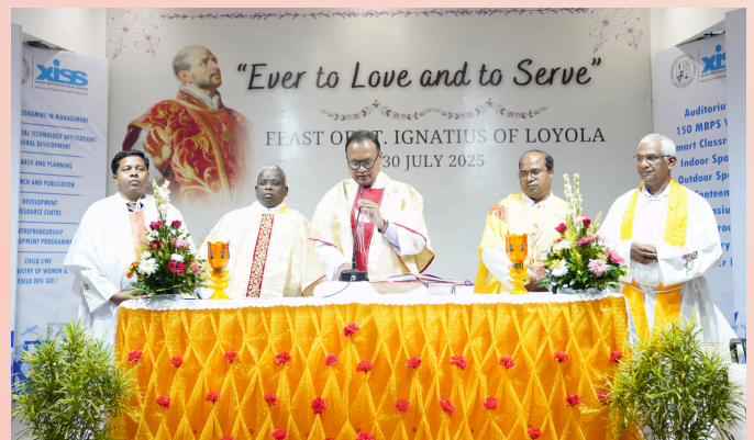
Special celebration to commemorate Feast of St Ignatius of Loyola

The holy festival concluded by blessings amongst the audiences including faculty, staff, guests and, students of XISS.