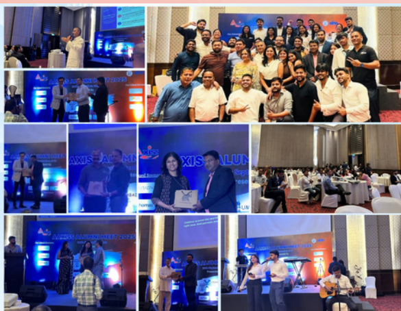
AAXISS Mumbai Chapter held panel discussions during the Alumni Meet 2025

Theme of discussion: "Accelerating Leadership Capital and Partnering to the Future"