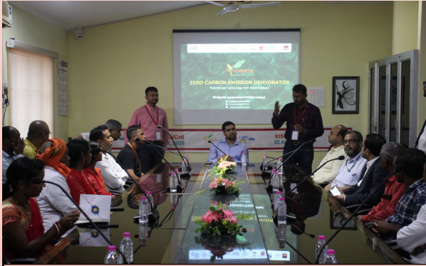
XISS & SwitchON Foundation organizes “Move for Earth Symposium 2025”