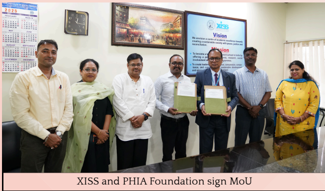
XISS and PHIA Foundation sign MoU

This collaborative journey is towards academic growth, social transformation, & capacity building.