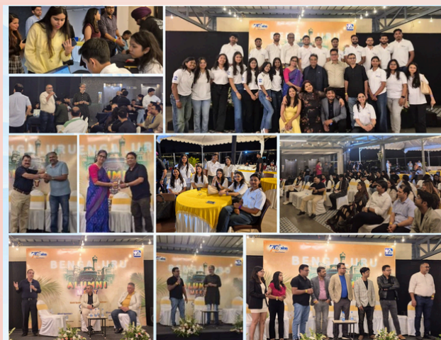
AAXISS Bengaluru Chapter successfully hosted panel discussion during Alumni Meet 2025

https://xiss.ac.in/news/aaxiss-bengaluru-chapter-successfully-hosted-panel-discussion-during-alumni-meet-2025