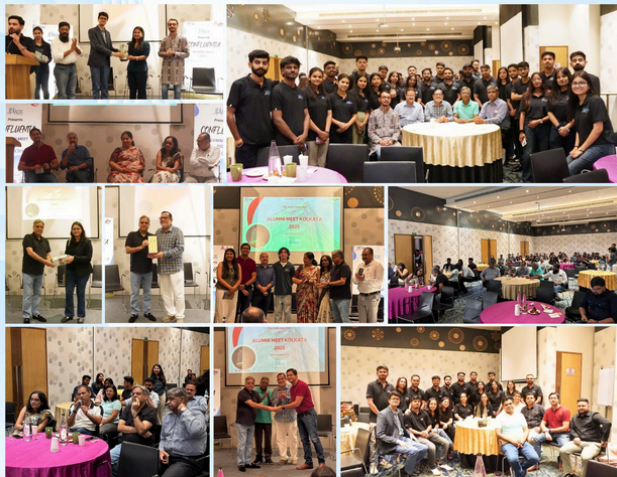
AAXISS Kolkata Chapter hosted a panel discussion at the Alumni Meet 2025

Theme of the panel discussion: "Climbing the Ladder without losing yourself: Integrity in Business and Life"