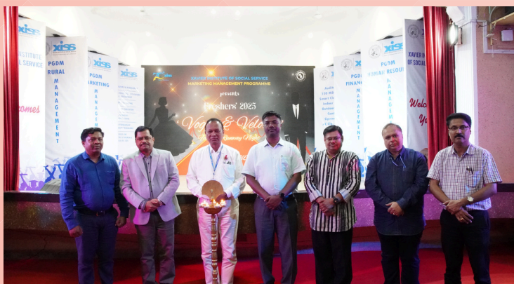
Fresher’s Day marked a warm welcome for the new batch of 2025-27

Mr & Ms Fresher’s chosen from all programmes.